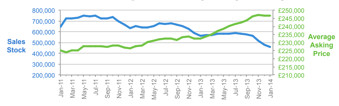
Chart 1: Total Volume of Sale Properties and Average Asking Prices (England & Wales)

* Gov.uk Live Tables: Dwelling stock by tenure ** According to National Well-being – Households and Families, 2012 by Ian Macrory: Office for National Statistics: Single person occupancy in 45 to 64-year olds has shown the strongest growth since 2001, with a 36.2 per cent increase to 2.4 million.